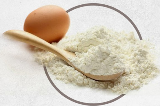
Dehydrated Whole, yolk and white

Animal welfare is a global trend that meets the increasing demand of an increasingly demanding and attentive consumer market. We want solutions for your business when it comes to Cage Free Eggs.