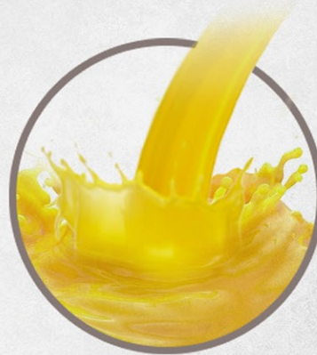
Liquids Whole, yolk and white